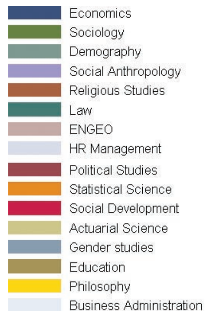
Registered Students 2004: Field of Study