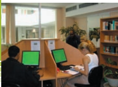
The Data First Resource Centre

“The acquisition of our server and the increased speed of our computer network have allowed us to expand our level of access as well as improve the security of our data.”