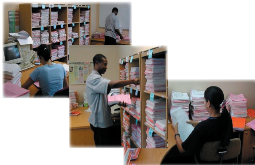
Sorting CAPS questionnaires in the CSSR

A major challenge facing panel studies is to reduce attrition among our sample of respondents. We shall be running a massive operation to track our respondents in order to reduce attrition. Planning for this began in late 2002.